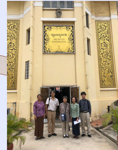
National Archives of Cambodia (2018)