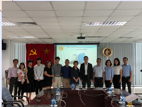
Institute of Social Sciences Information, Vietnam (2018)