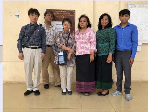
National Library of Cambodia (2018)