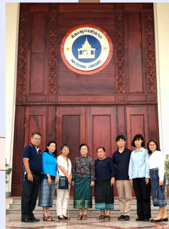
National Library of Laos (2018)