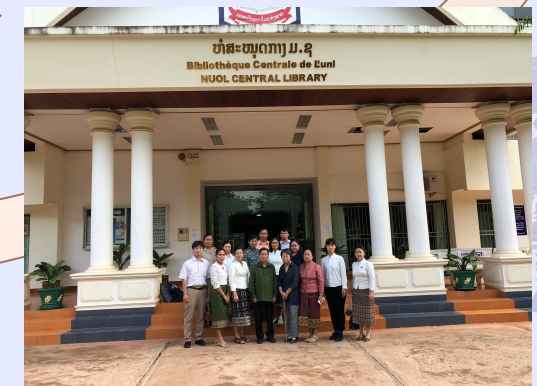
University Central Library, national University of Laos (2018)