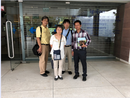
Hun Sen Library, Royal University of Phnom Penh (2018)

DB: https://info.cseas.kyoto-u.ac.jp/db/sealib/